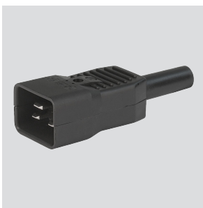
IEC C20 15A Plug (60320)