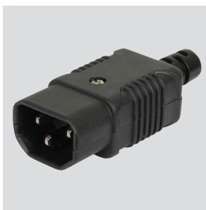
IEC C14 Plug 10A (60320)