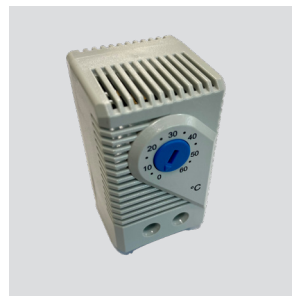
Thermostat 240V AC -20 +80°C