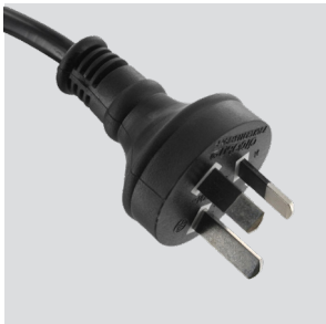
AUS Outlet Moulded 3 pin Plug